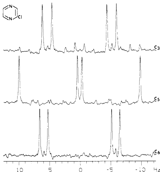
Figure 1. Cross sections of 2-D spectra of 2-chloropyrazine as obtained by the MPT pulse sequence; 128 data sets were created by systematically increasing the evolution time t_1 in steps of 40 ms. Signals of three chemically nonequivalent CH groups were found as a function of t_1 and Fourier transformed. Since coupling with the directly attached proton ( ^1J_{\text{CH}} ) has been eliminated in this experiment, only couplings with two distant ones are revealed for each ^{13}\text{C} nuclear site. Total measuring time was only 30 min.

At the middle of the evolution time two \pi/2(x,\text{H}) pulses are applied. The first one turns protons from the \pm z into \pm y directions of the rotating frame. If they are directly attached to ^{13}\text{C} spins, one-bond coupling ^1J_{\text{CH}} flips them for 180^\circ from the \pm y to \mp y